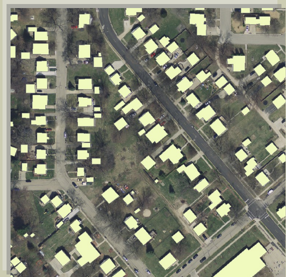
Building Footprint Layer Beginnings