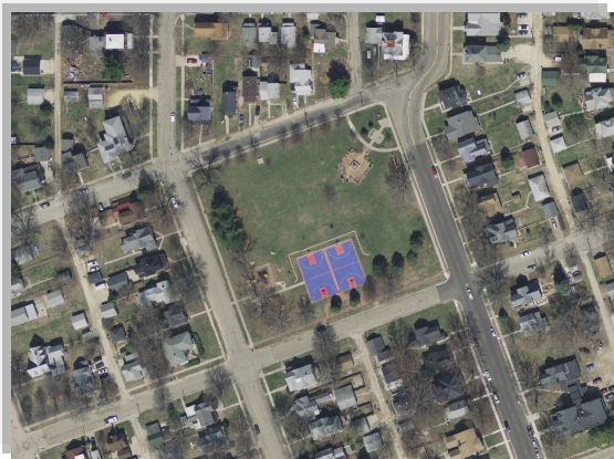
New Aerial View of Propheter Park, Sterling, IL

To compare, the previous county wide imagery was taken in black and white and had a one foot resolution. Imagery in urban areas were at a six inch resolution in black and white. The new imagery has been captured in color at a resolution of six inches over the entire county. The color images allow for greater clarity in identifying structures and land use portrayed in the image.