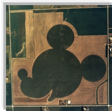
Field in Iowa