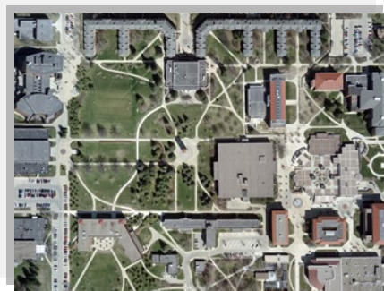
Campus of University of Northern Iowa